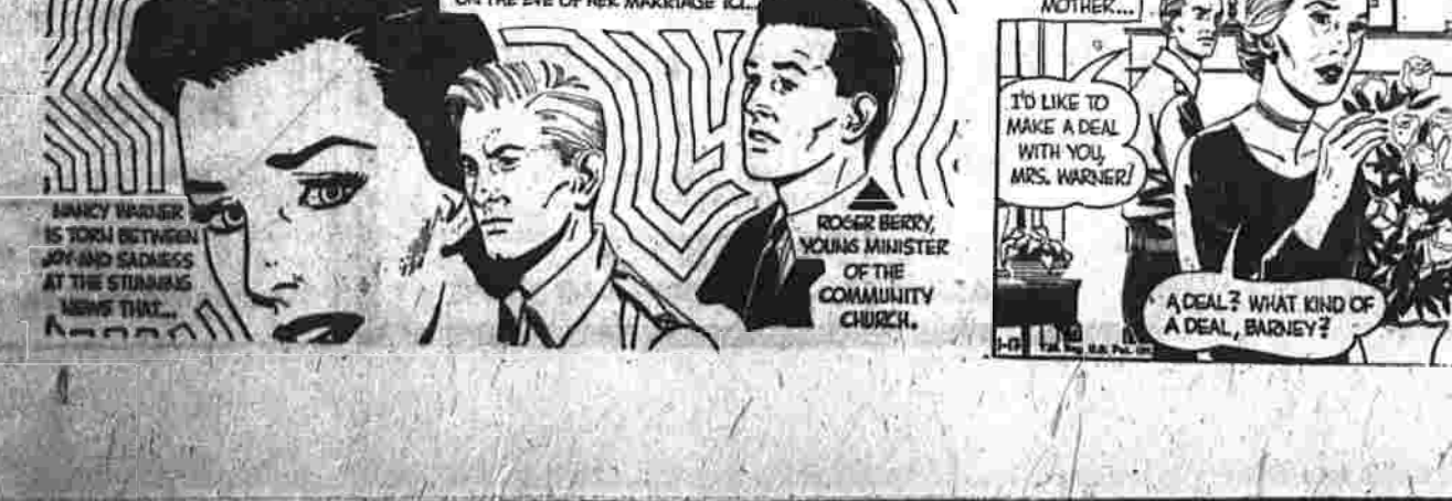
THE STORY OF MARTHA WAYNE